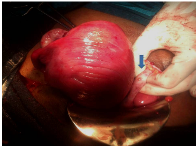
Figure 2: Intra operative image of Unicornuate uterus with no horn after delivery of the baby in cesarean section. Arrow pointing at left ovary attached to lateral pelvic wall and absence of left fallopian tube.

extension of the uterine incision on the left side (Figure 3). A postoperative ultrasound abdomen also revealed absent left kidney. The other patient had a unicornuate uterus with a non-communicating rudimentary horn (Figure 4), which was noted during cesarean delivery which was performed for fetal distress.