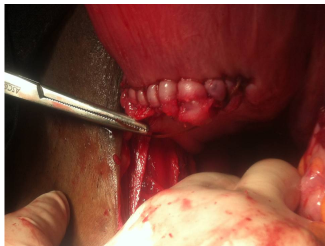
Figure 3: Intra operative image showing posterior extension of uterine incision in cesarean section of patient with Unicornuate uterus with no horn.

One case of complete bicornuate uterus was identified after a vaginal delivery, which was referred from a rural centre for further management of oligohydramnios at 36 weeks gestation. Patient also had a cervical stitch insitu which was removed and labor was induced at term. A suspicion of uterine anomaly arose during delivery and a postpartum ultrasound at our centre revealed a bicornuate uterus.