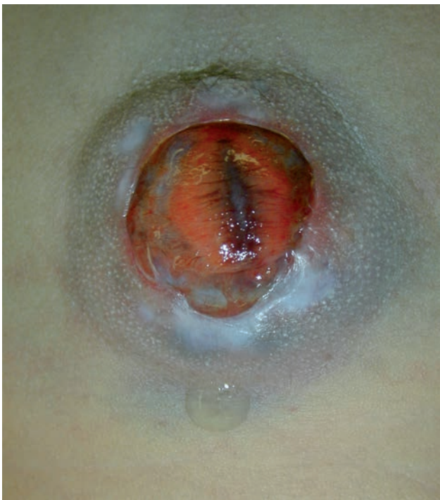
Fig. 1. Clinical photograph showing a typical myelomeningocele. The open spinal cord is readily appreciated, with the midline fold continuous rostrally with the central canal of the spinal cord. Leaking CSF can also be seen.

The term spina bifida is used to refer to a range of different conditions. The simplest form is incomplete closure of the posterior elements of one of the lower lumbar or sacral vertebrae. This is very common (around 10% of the population) and incidentally noted on X-ray, but seldom of any clinical relevance. Spina bifida occulta or closed spina bifida refers to a range of rare but characteristic congenital abnormalities involving the lower spinal cord, such as a lipoma, myelocystocele or split cord; usually there is an overlying cutaneous abnormality (such as a subcutaneous lipoma, naevus or hairy patch) and pathophysiologically the spinal cord is tethered and vulnerable. Spina bifida aperta or open spina bifida is almost always a myelomeningocele, where the spinal cord and meninges are exposed on the dorsal surface of the infant at