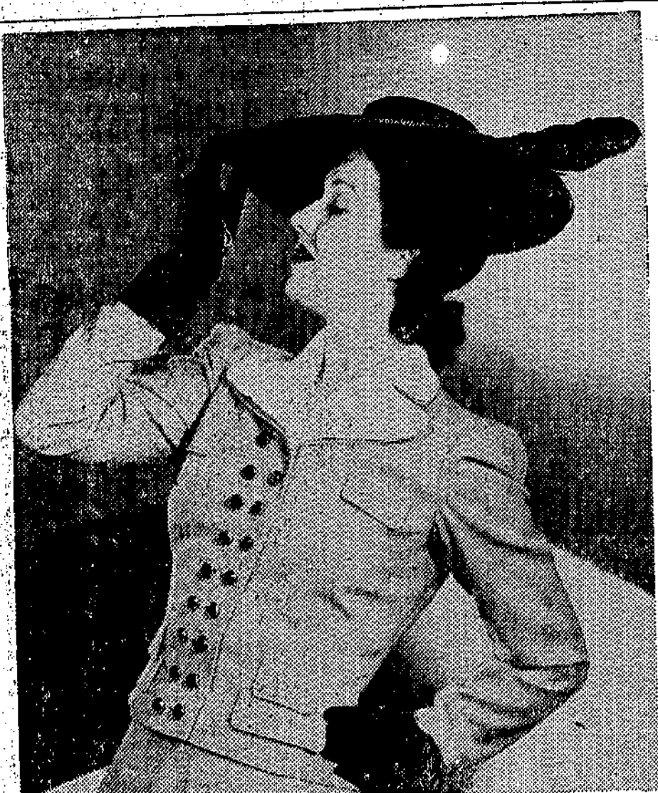
This charmingly matched ensemble—black gloves, red sailor and gray crope suit with silver buttons—is worn by CBS' lovely Ruth Warrick. Period fads will come and go, but this suit, tailored along severe lines, has an ageless quality. It is suitable for either town or country and, as all conservative things, will give you most service. (Creation of BenGinsberg, Inc., New York.)