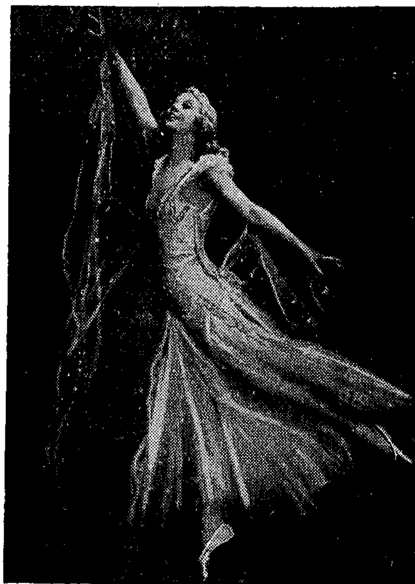
Maria Gambarelli, premier danseuse of the Metropolitan, who will appear Wednesday night at 8:30 under the auspices of the Cooperative Concert Association.