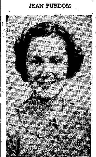
Resigned presidency of the 'Y' for 1938-39.