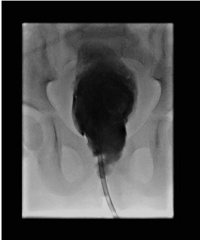
Fig. 2. Frontal fluoroscopic image of the pelvis demonstrating pigtail catheter within the vagina (opacified with contrast media). Note that the pigtail catheter is entering from below (from the introitus in this case).

fluid in the vagina as documented by multiple ultrasound studies. She may still require a formal reconstructive surgery later in life.