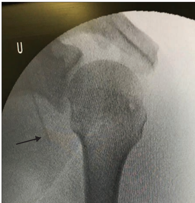
Fig. 2. Case 1. Intraoperative radiograph showing an etonogestrel implant lying anterior to the left shoulder (arrow indicates tip of implant).

A 28-year-old woman was referred to the difficult removals clinic from a community clinic after failed removal of a palpable but