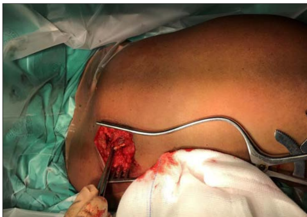
Fig. 3. A 6 cm incision through which an etonogestrel implant was found and removed from the deltopectoral groove within the cephalic vein.