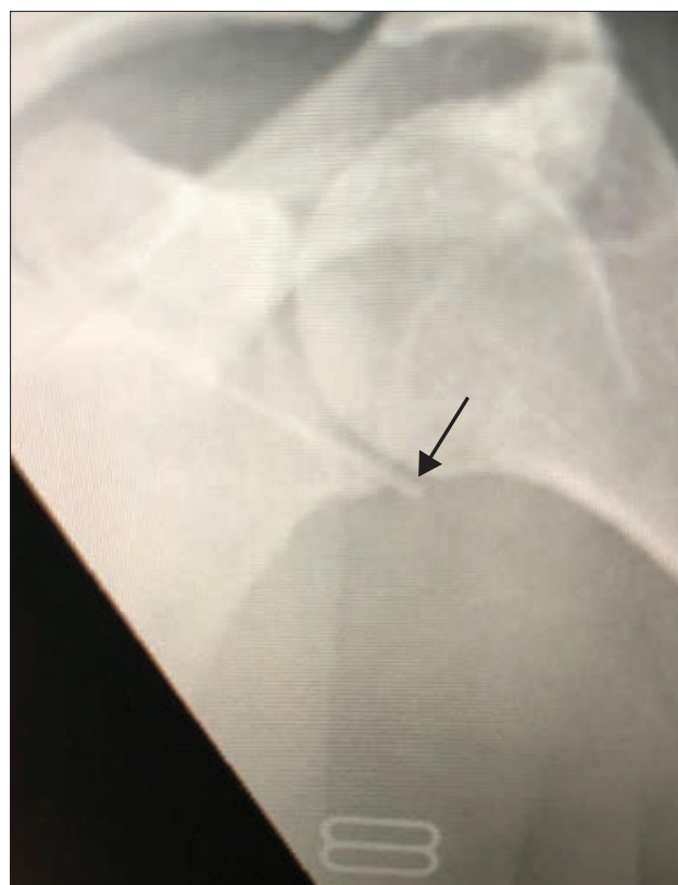
Fig. 1. Case 1. Radiograph of left upper arm demonstrating implant location above the glenohumeral joint, in the deltopectoral groove (arrow indicates tip of implant).

The radiograph revealed a linear foreign body just above the glenohumeral joint in the area of the deltopectoral groove (Fig. 1). The image was compatible with a radio-opaque ENG implant. Surgical removal of the implant under general anaesthesia was performed on the same day by two of the authors. The patient was