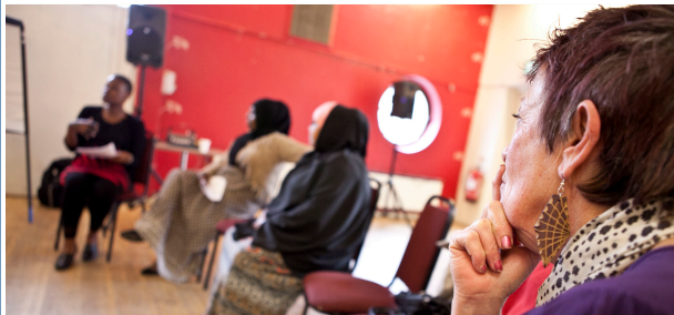
A training led by the Foundation for Women's Health Research and Development (FORWARD), a UK-based accredited training provider on FGM/C and registered charity.