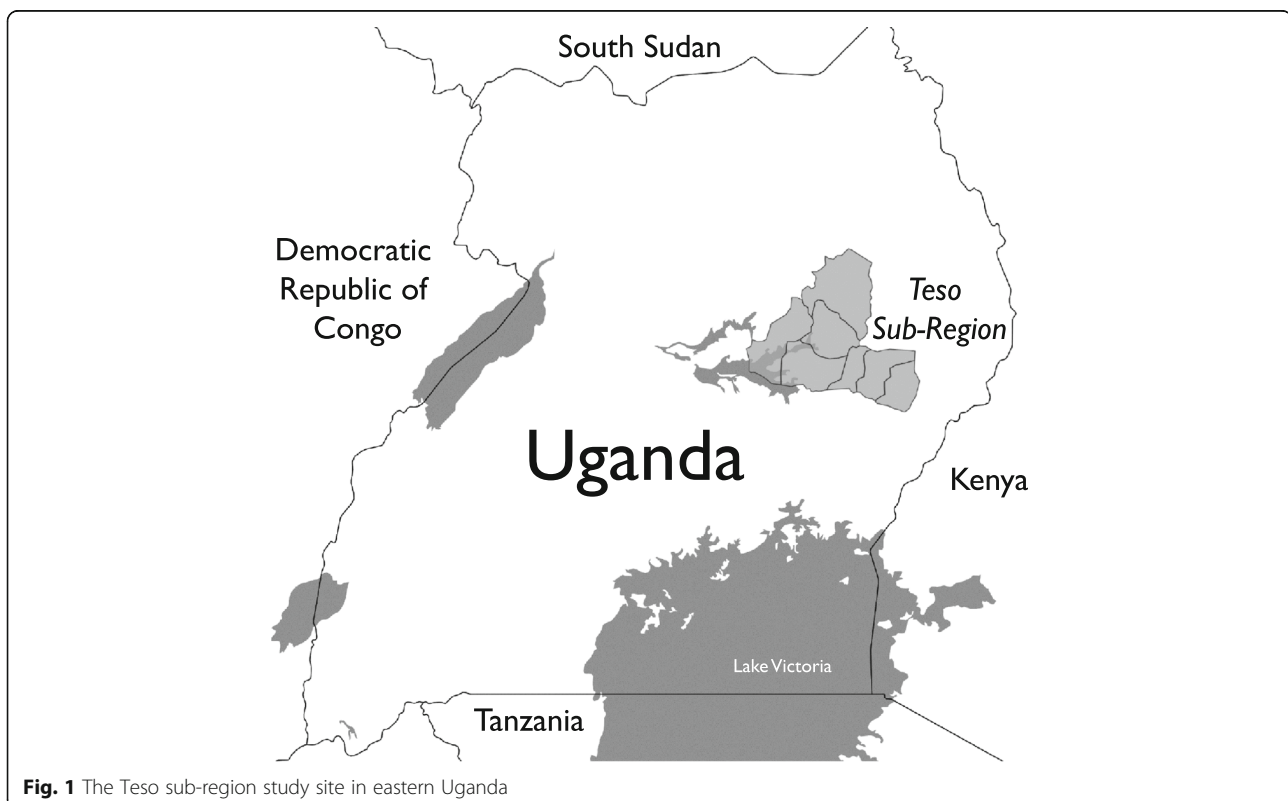
Fig. 1 The Teso sub-region study site in eastern Uganda

We estimated that including four of Soroti's ten sub-counties in our study would give us enough opportunity to identify commonalities and differences between sub-counties and reach data saturation among different participant groups of interest. As the majority of Uganda's population lives in rural areas where the gap between health needs and available services is greatest, we excluded all sub-counties that did not have a predominantly rural population ( n = 4 ) [24]. For feasibility reasons, we then excluded one sub-county where the majority of residents did not speak Ateso. Of the five remaining sub-counties, we randomly selected four for inclusion. Together, these sub-counties represent a predominantly rural, Ateso-speaking population living at various distances from the regional hub in Soroti municipality.