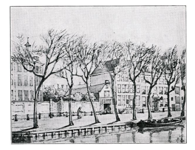
Figure 2. Picture of the First Amsterdam Jewish Ashkenazi Hospital and Old Age Home, Previously a Tavern Known as the Imperial Golf Course, Established in 1833.<sup>16(p76)</sup>

Two more adjoining houses were quickly procured which allowed a newly rebuilt and enlarged Jewish Hospital and Old Age Home (Figure 3)<sup>23</sup> to be opened in 1840, located on the Nieuwe Kerkstraat, previously known as the Weesperveld.