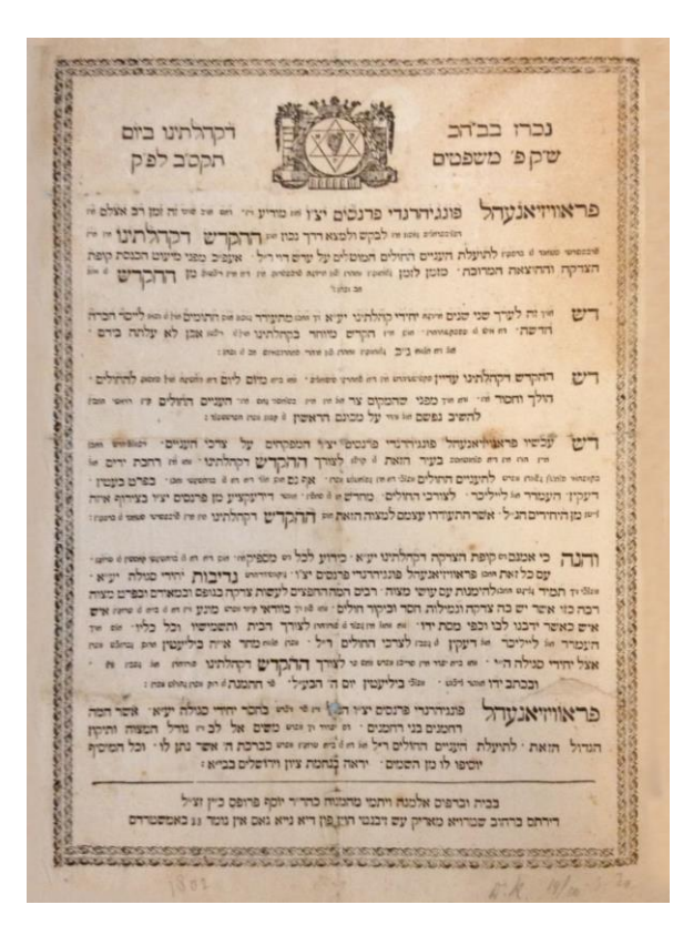
Figure 1. The Synagogue Announcement Requesting Financial Support to Build the First Jewish (Ashkenazi) Hospital in Amsterdam.<sup>9(entry 714, no. 21)</sup> See Appendix.

Pinto, and Voet) decided that a Jewish hospital could provide better and more efficient care for the seriously ill destitute than the traditional one-onone treatment of a patient by a district doctor who had to travel to the patient's home.<sup>20</sup> Furthermore, they realized that it would be much easier for lowerclass Jews, who were generally ritually observant, to follow their religious practices and customs, including obtaining kosher food, among their coreligionists in a Jewish hospital than in a municipal facility. Finally, the success of the London Jewish Hospital (built in 1748) was also considered a favorable indicator. In 1802, an announcement (Figure 1)9(entry 714, no. 21) was made in the Amsterdam main synagogue that the current Hekdesh (a communal shelter and infirmary for the poor, transient, and the sick)4(s.v. "hekdesh") was in poor condition and inadequate to meet the needs of the indigent sick. Consequently, the Parnasim(A) were requesting financial support to buy a spacious house and equipment to be converted into a hospital where sick paupers would be treated and recuperate. This appeal was successful.