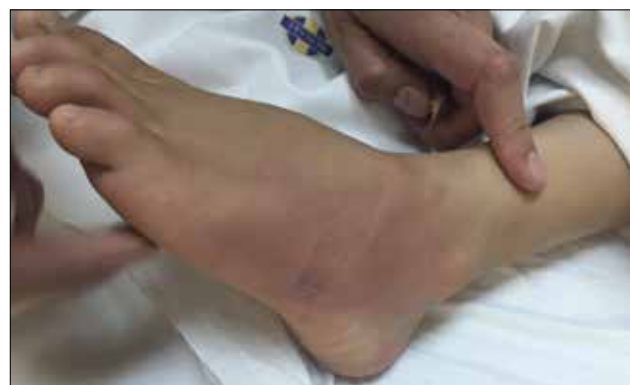
Fig. 1. The left foot, red and slightly swollen.

A cranial computed tomography scan of the brain was normal. Standard routine laboratory blood tests (Table 1) as well as