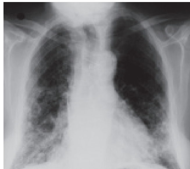
Fig. 1. Above: chest radiograph taken in 1996, showing cardiomegaly and old asbestosis plaques. Below: the current film, showing cardiomegaly and interstitial changes mainly at the bases with no signs of cardiac failure.