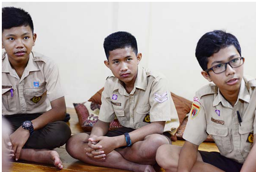
Students in Central Java discuss their school environment.

For the most part, the school environment described in the data collected was relatively mild with respect to violence. (This could simply reflect the particular schools that were available for the conduct of FGDs.)