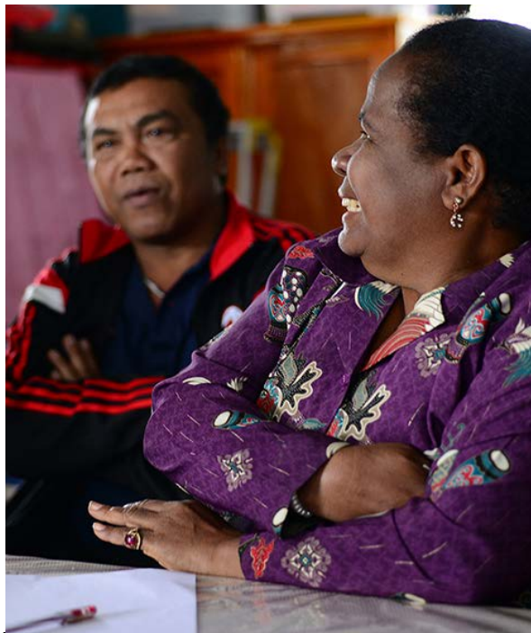
Teachers discuss positive discipline in their school.

Reproductive health information is included in Community Connections sessions. Youth are knowledgeable to some degree about reproductive health, possibly due to the project. For example, they know about menstruation. The project taught them about relationships with friends (boys and girls). With other girls, they have been taught not to gossip about their friends in order to avoid creating conflicts. The World Relief program staff tells them to be close to God and respect their parents. Regarding boys, the girls learn from these sessions to be careful, not to participate in night parties. Girls say that boys like to do bad things to them, and they don't like this. They have been taught that it is okay to date someone but not to have sex before marriage, and if necessary to use condoms. The boys been taught that it is acceptable to "play with girls but no sex", for risk of HIV and pregnancy. Female students said that some of their friends already have babies.