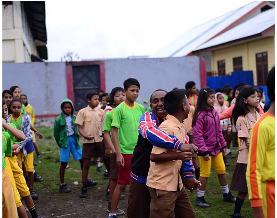
Students start the day with morning exercises in Papua.

The SDN Wamena principal agrees that child friendly schools and positive discipline have a positive impact on the students in that they enjoy being in school, are happy, and have fun learning. The students are able to express their thoughts and feelings more, and become more confident in doing so. However, a long time is needed for change. She also believes that positive discipline for East Indonesia, including Papua, needs to be adjusted for the culture. [Again, referring to the expression that is widely known, “In the tip of the stick, there is gold” -- that is, disciplining children by hitting them is good for children and will help them succeed.]