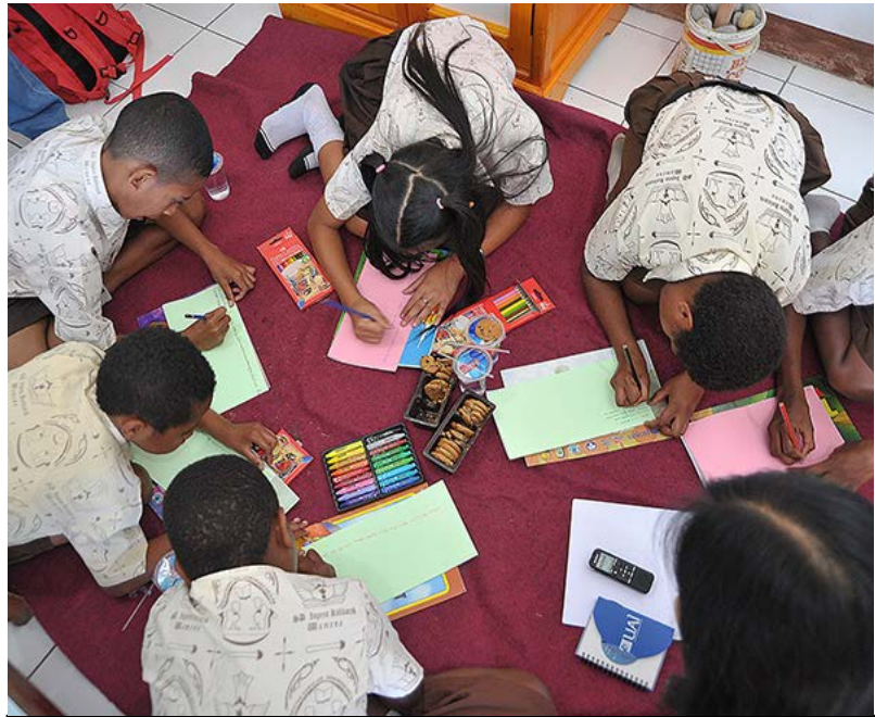
Students drawing during an FGD in Papua.

Regarding the Safe and Strong Schools program (and HIV and AIDS education), SMPN Bolakme students (11-07-15 FGD) like the materials because there are people they know who are infected with HIV, and they do not want to get infected. If their friends do something bad, they will ask their friends nicely to change their behavior towards more positive behavior, and advise them that their behavior is not in line with God's teachings (SMPN Bolakme Students, 11-07-15 FGD). They have been taught to be themselves, and not to join friends to get drunk. Similarly, teenage volunteers like the Community Connections materials for multiple reasons, including the following: the curriculum teaches them about substance abuse, HIV, violence against teenagers; the curriculum fits to the context, especially because it is being translated in their language; because there are Community Connections sessions in the schools (in rural areas), the information relayed in school has enriched the information delivered in church sessions; community sessions also reach young people who do not attend the school sessions; and the sessions are being delivered to the teenagers' parents (GKII Gume, 11-07-15 FGD).