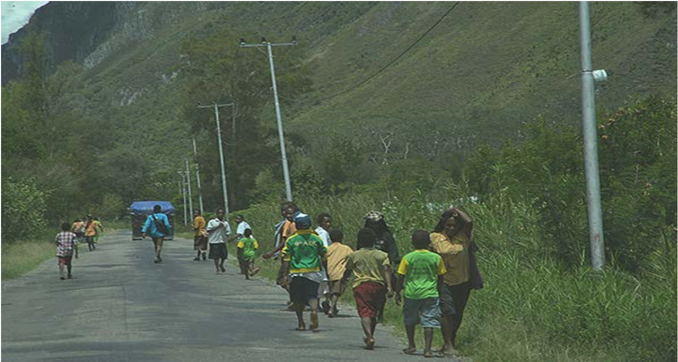
Papuan children, many without shoes, walking to school from a nearby village.