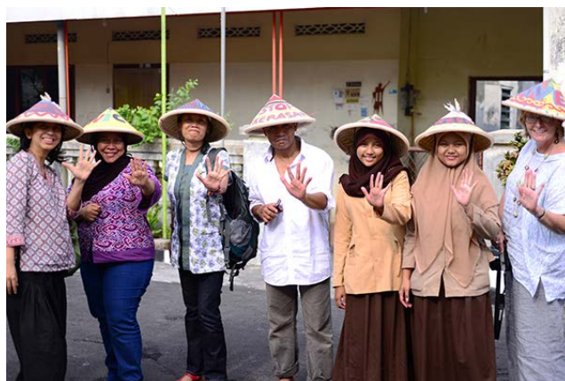
Research Team members and their hosts don traditional hats for a rally in Central Java calling for an end to violence against children.