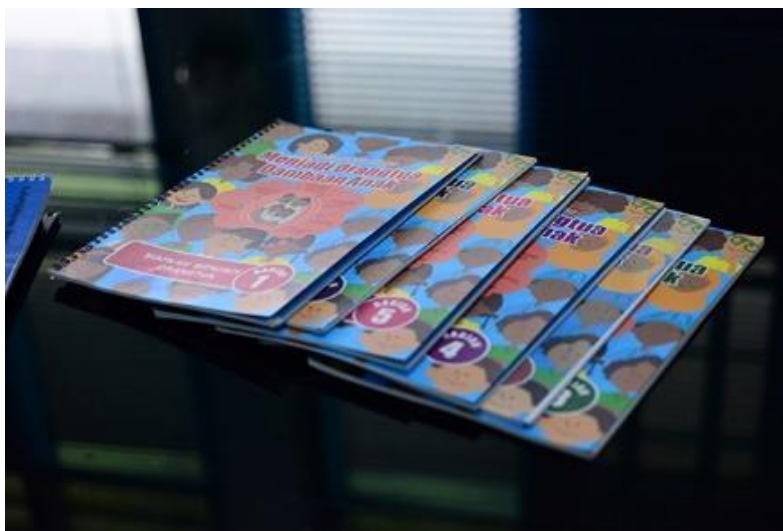
Modules for a child violence prevention program adopted from UNICEF materials to fit the local context.

In South Sulawesi, UNICEF Indonesia has been working with a Child Forum on peer support, in connection with children on violence prevention in schools (no documentation available) and on parenting, with the government and religious leaders (CCP, 2013). UNICEF Indonesia shared that the parenting module is not yet published, but agreed to by all and the government has initiated roll out. No baseline exists for this work, though in pre-site visit responses program staff refer generally to a 2013 baseline KAP study (CCP, 2013) and two 2014 studies conducted by Universitas Negeri Makassar (2014a & 2014b). UNICEF Indonesia also has a number of justice for children partnerships to address children in conflict with the law, and to ensure they are not sent to prison, but rather diverted through community-based mechanisms. Some partnerships are in place with civil society with this work (no documentation available). The programs are implemented in urban slum areas of Makassar City and village contexts in Gowa District.