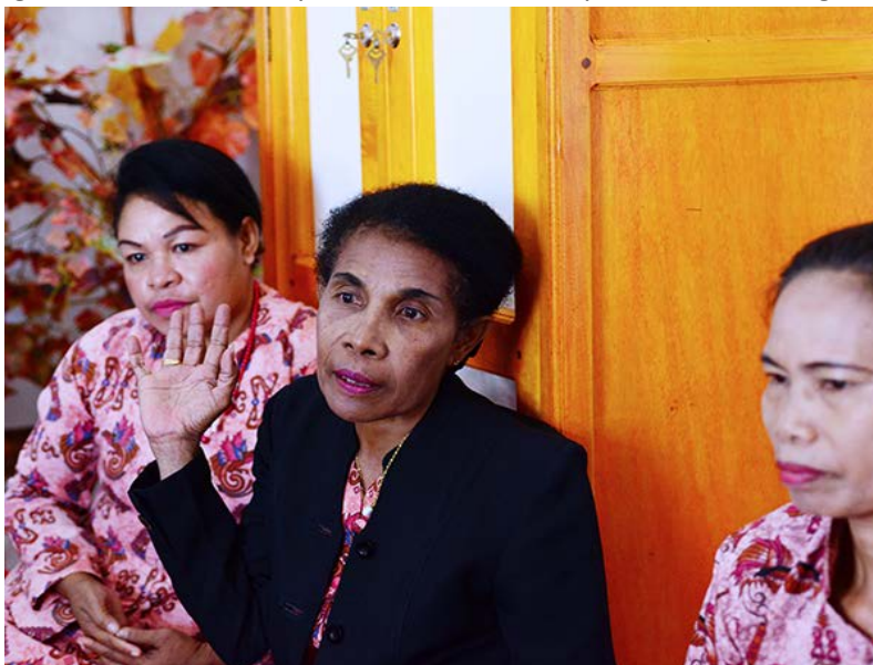
“A frequent meeting like this would help us better implement positive discipline.” A teacher at an elementary school in Papua.

Barriers to behavior change. The behavior change environment at the intersection of schools, homes, and community is complex. Teachers reported being challenged by parents for being too lenient; children reported inconsistent and confusing responses to behavior from teachers and parents. Teachers in SD Kulitarek (11-05-15 FGD) said that sometimes, there are students who take the teachers lightly because they are no longer using physical punishment. They have to find a way to approach the students in a non-violent way and learn about their problems. But students, they say, are getting naughtier; they are being spoiled and do not want to hear the teachers anymore. Students in faraway villages are more submissive than students in the city. Positive discipline can be implemented in these villages but it is challenging to implement it in the city [of Wamena]. The program is not fully successful, according to teachers. Some students are misbehaving more since positive discipline was implemented. On the other hand, the HIV project is producing results. Many students are now asking good questions such as, “Why [does] my neighbor ha[ve] a baby while she’s still in high school?” However, teachers are still coming late to school. During class observation, some teachers admitted that they have not even been trained on positive discipline.