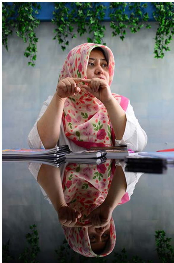
A UNICEF officer in Makassar explains the roles of the provincial government and NGOs in the interventions.

responsibilities for protection, including health, education, justice, and social welfare. UNICEF reported that their work on this component is complete and there are no plans in place to support implementation.