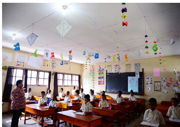
“Good morning. Welcome to our school.” Inside an elementary school classroom in Wamena.

noticeable community support for schools. In an interview with the principal at SD Kulitarek (11-05-2015), he said that many parents care about the school. They donate a lot of money and building materials (Note: This school is the only school that was being inaugurated by the head of the Jayawijaya education office). The school committee at his school will soon get training from Jakarta on community capacity building. Teachers at SD Kulitarek (11-05-2015 FGD) said that there is a competition for the most beautiful class. A focus group of 5 th and 6 th graders at SDN Wamena (11-10-2015 FGD) revealed a broad range of attitudes about school, largely positive. They want to go to school for several reasons: “To reach our dreams, to study lessons, to meet friends.” They like the lessons (some even mentioned math lessons), helping teachers do the dishes, cleaning the classrooms, pictures of heroes in the classrooms, teachers who are kind and love their students, and playing with friends (though the girls mentioned that many boys in their classes misbehave; they like to bang their desks or annoy the girls).