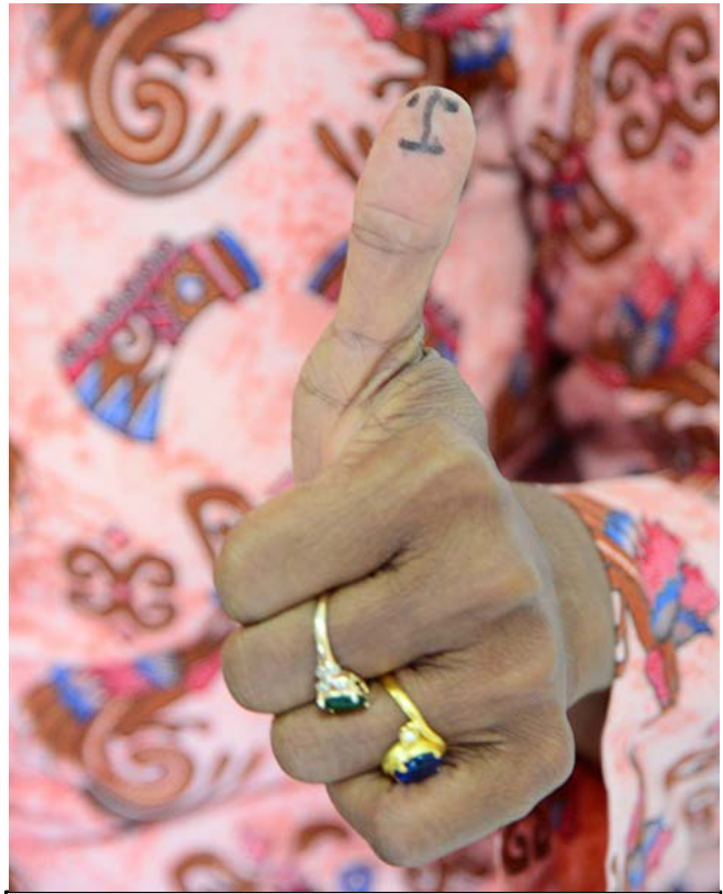
“Positive discipline is easy as showing your thumb to your student,” says the principal of a school in Papua.

SD Abeale teachers (11-10-15 FGD) reported that their first project with UNICEF is what they call school-based management. One of the punishments involves teachers asking students to write in their books to apologize for doing wrong. Positive discipline messages are also being disseminated to parents during report distribution (every six months). Children have to read for 15 minutes before the class begins -- this is to make reading a habit for students. Children are also asked to forgive each other if they have conflict with their friends. There is a (new) prayer room in the school that the teachers believe has increased the intensity of prayers at school, which will eventually change students’ behavior positively at school and at home. The FGD members also said that teachers have to be disciplined before disciplining others.