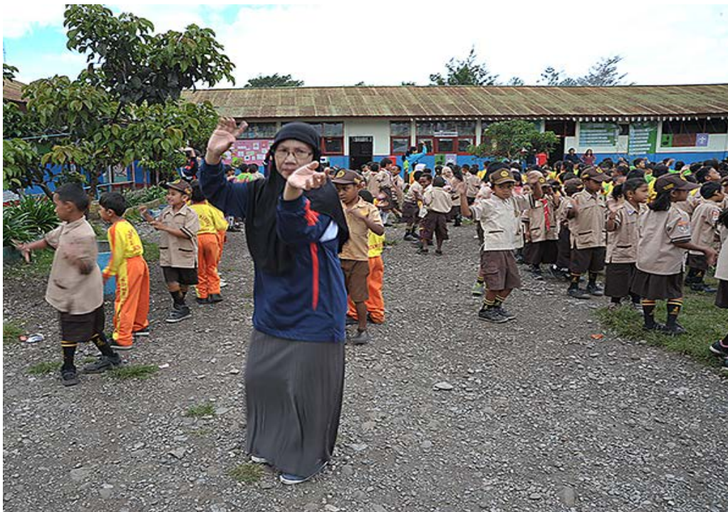
Dancing and exercising starts the day in an elementary school in Wamena.

day with the following routines: Wake up early, help with chores at home – mop and the floor, washing the dishes, they go to school, by walk or motorcycle – dropped by their parents, they start the day in school with exercise together on the field, cleaning up the classroom (student on duty). There are rules that students have to follow: Go to school on time, throw garbage in garbage can, keep quiet, do not hit friends, do not say bad words. Said one student, “If I follow the rule, I will get a good grade, the teacher won’t get mad at me.”