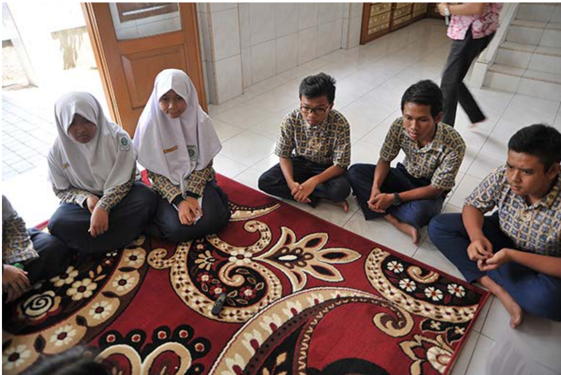
“Our boarding school implement[ed] positive discipline. We are asked to [be] responsible for our acts.” A student in Central Java.

Students at Al Islam Middle School (11-19-15 FGD) described the following changes in their school over the past three years: new facilities, more empathetic teachers that encourage a more positive learning environment, teachers for specific subjects, a new curriculum that emphasized leadership and organization, more learning supplies (e.g., computers), and more extracurricular activities. Students noted that teachers have also begun opting for less physical punishments. Instead of, say, asking children to run around the school, they will be instead be asked to memorize a verse from the Koran. In a demonstration of the growing warmth between teachers and students, one child noted that “[T]he teacher in school is like the substitute of parents at home, and they also pay attention to us, not only teaching us” (11-19-15 FGD). There are also fun activities in school, such as scouts and outdoor activities.