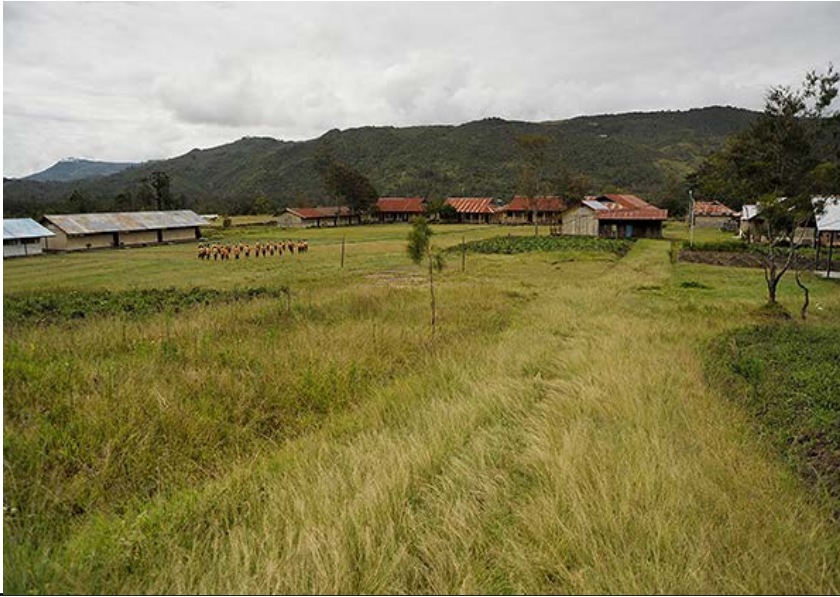
A school compound in Bolakme, Wamena.

environment ambassador club. Students are free to join the clubs but usually the teachers select members of these clubs based on the student's interest. Patterns of discipline are similar to that reported in other FGDs. Teachers issue fines to students who carelessly throw garbage or step on the grass or flowers; however, students are involved in determining how much they should pay if they misbehave. All fines are used to support school activities, including the purchase of supplies such as water. The punishment for not doing homework is to do it outside the classroom and/or a reduced score. Students in this FGD appeared to subscribe to these rules. The student respondents like to have rules so that they can be disciplined one day. "Discipline is the key to success," said one of the students.