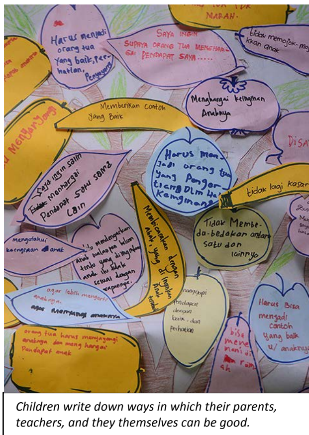
Children write down ways in which their parents, teachers, and they themselves can be good.

In the trainings, parents are shown videos about how children actually imitate their parents. They also visited schools. “Instead [of] waiting for cases to come to our organization, it’s better for us to give information. We heard that the school [has] many problematic students. We just visited the school, the four of us and we share our knowledge about violence prevention to students. We gave them [a] questionnaire first, asked about their feeling and how they view violence. We plan to have another campaign, using Ice Cream Stick and make photo frame using the root of plants” (11-14-15 FGD).