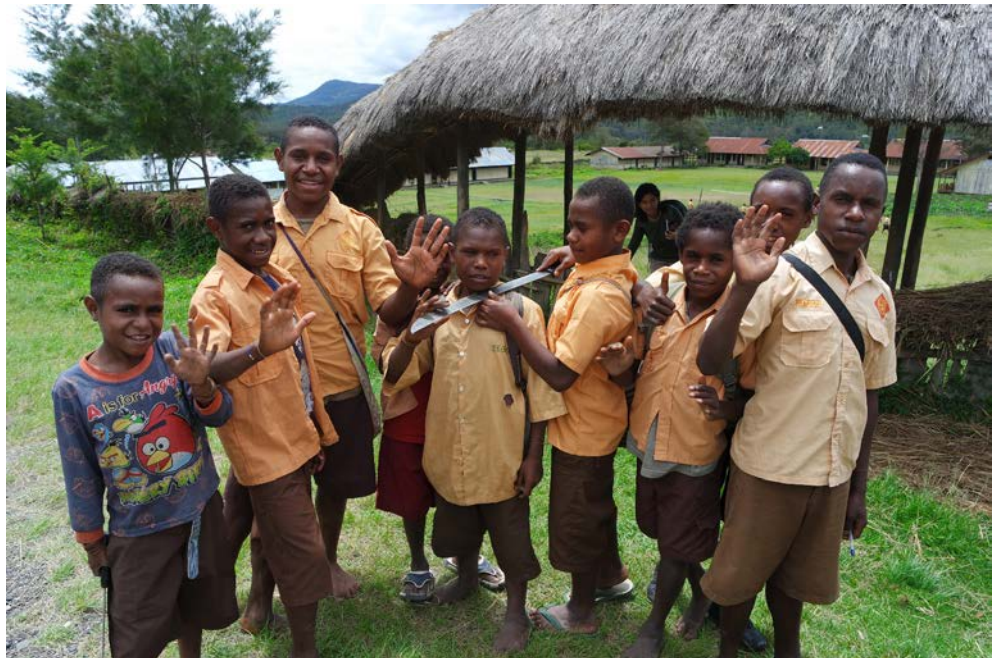
Children at a school in Papua, a site of the Community Connections program.

Gossip leading to conflict was also mentioned. The environment of violence in these communities is physical and psychological. Community volunteers in an FGD in GIDI Filipi Homhom (11-05-2015 FGD) noted the normative and habitual nature of domestic violence, wherein children are being beaten harshly without reasons or advice given. "If there is no food at home, women are beaten by their husbands. [The norm is] Parents can beat the children as long as it is followed with advice" (11-05-2015 FGD).