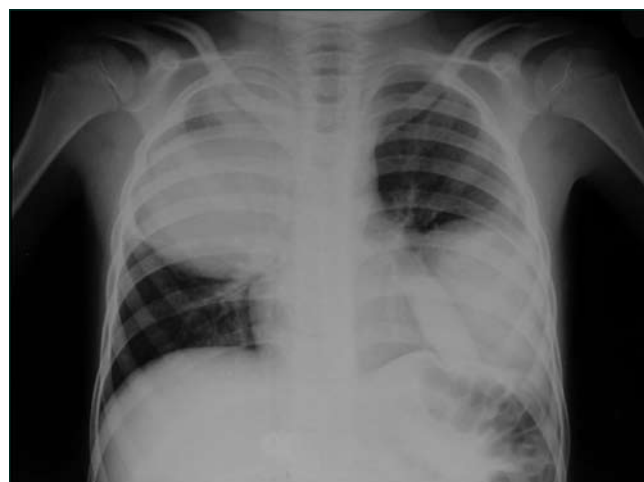
Fig. 1. Chest radiograph showing a bilateral well-circumscribed dense lesion.

The patient was treated with high protein intake, dipyridol and captopril; both right lung cysts were resected,