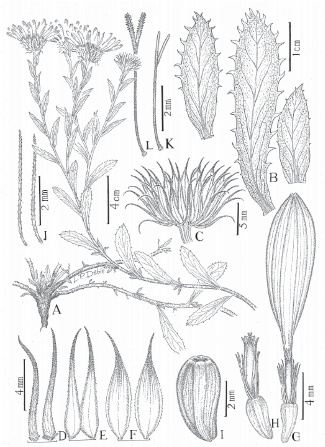
Fig. 3. Grindelia atlantica Deble & Oliveira-Deble. A: branch. B: leaves. C: involucre. D-F: involucral bracts. D: outer. E: median. F: inner. G: ray flower. H: disk flower. I: cypsel. J: awns of pappus. K: style of ray flower. L: style of disk flower (A-L, Deble & Oliveira-Deble 9.555 holotypus CTES).