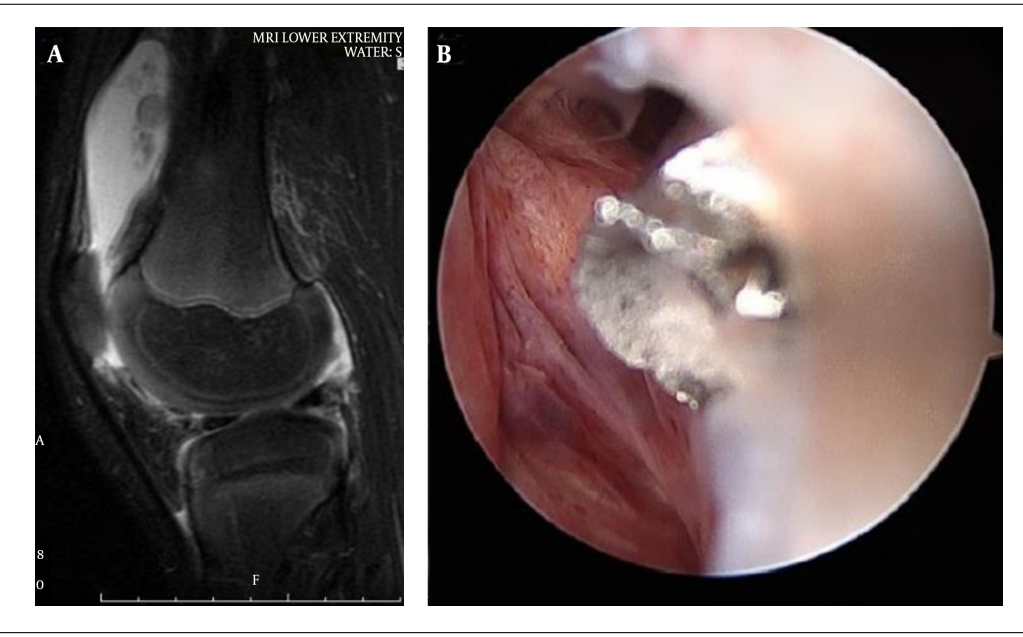
Figure 2. A, MRI of the knee; B, arthroscopic image - tip of the flexible nail protruding into the knee joint.