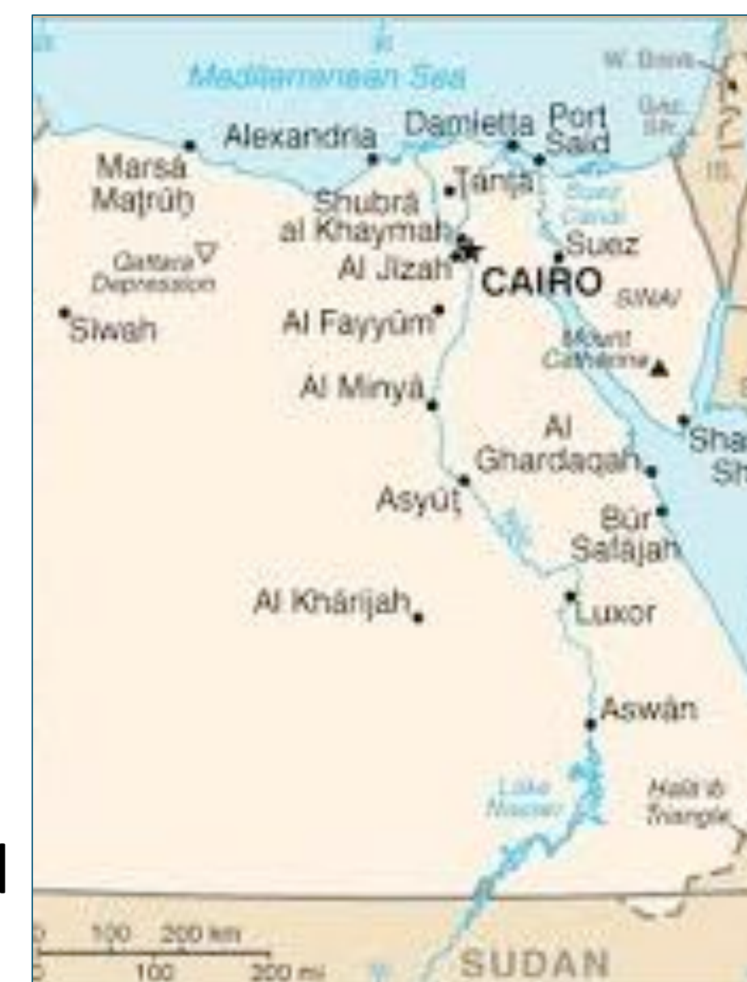
Figure 2: Map of Egypt

Setting: Egypt is the most populous country in the Middle East and North Africa Region, with a population of about 83 million. 49.5% of the population are below 15 years of age and 3.4% are 60 years and above. Since January 2011, Egypt has been undergoing rapid political and societal transitions coupled with a serious economic crisis.