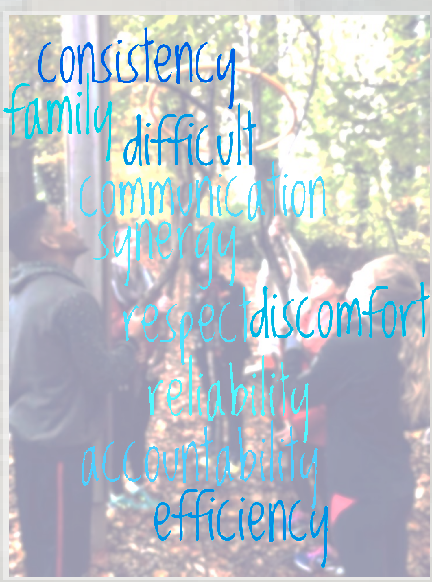
The team learns what teamwork is all about at the SUMMIT Outdoor Challenge Course.