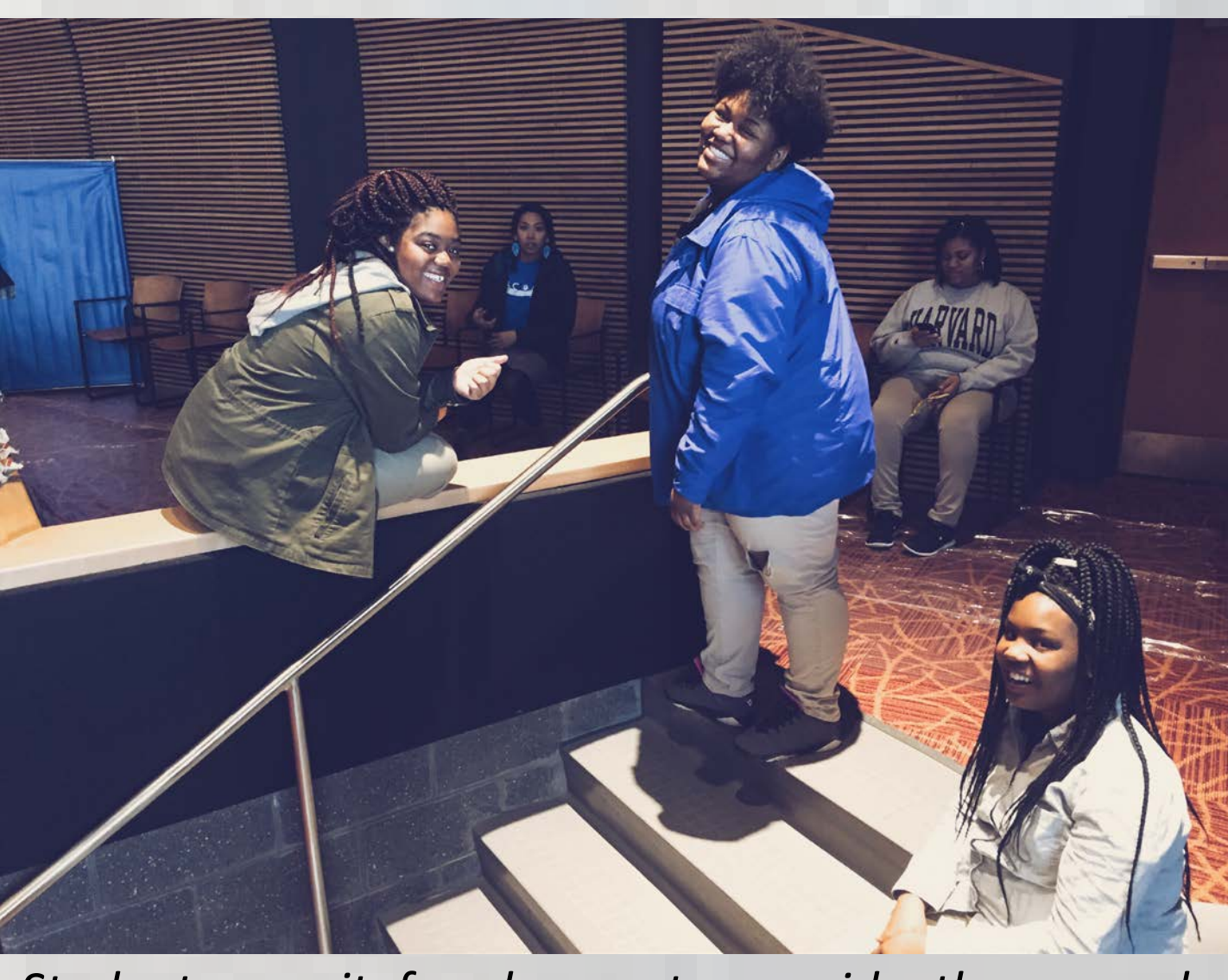
Students await for donors to provide them snacks and drinks at the Red Cross Blood Drive.