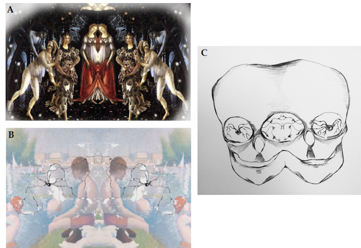
Figure 2. (A) Graphic depiction of reproduction of connection between the artist and art receiver; (B) Graphic depiction of mirror neurons and information transfer from the artist to the art receiver; (C) Graphic depiction of direct connection between the artist and art receiver via mirror neurons. From Julia Andrzejewska with permission [36].

in the art receiver/observer and igniting the simulation of respective motor program based on the visible creation marks as mentioned above. These marks would match the artist's goal directed movements and hence would activate corresponding areas of the art receiver's brain as part of the 'embodied simulation'. Along these lines, Gallese suggested that motor simulation can be induced by static work of art, but not someone's direct action. These complex relations between the artist and art receiver are graphically represented in Figure 2A–C.