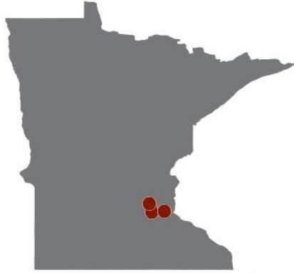
ABA-Approved Law Schools in MN*