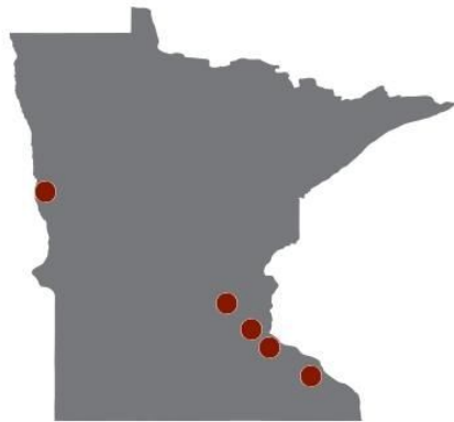
ABA-Approved Paralegal Programs in MN*

Ultimately, licensing paralegal programs could provide services of equal quality in a limited scope and encourage more legal service providers to be in greater Minnesota. Overall, quality and quantity of legal service providers at different levels - paralegal practitioners and lawyers - can bridge the justice gap.