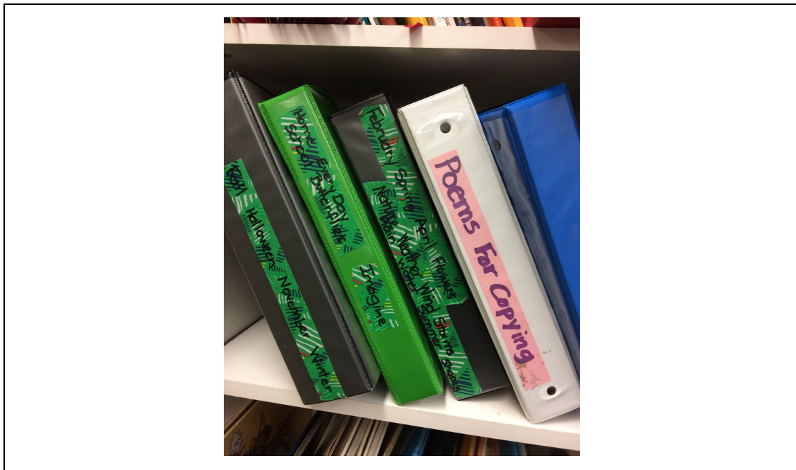
Figure 4. Binders full of poem written by former students.

have collected over the past two decades, and at the numerous binders of former students' poems that I have kept and put into "themes" over the years, and long to find a place for poetry to grow again in my students' lives (Figure 4).