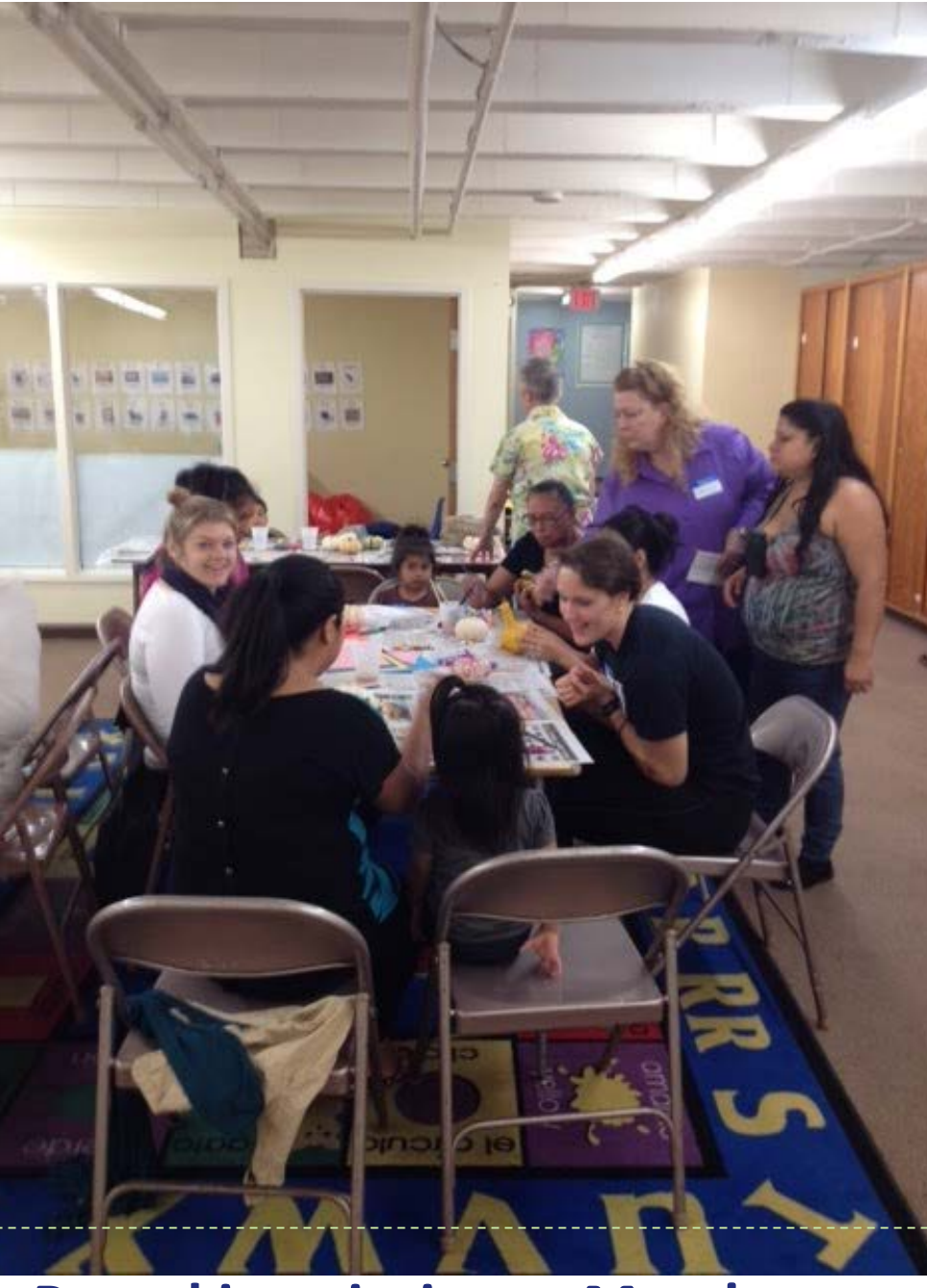
Pumpkin painting at Mary's Center