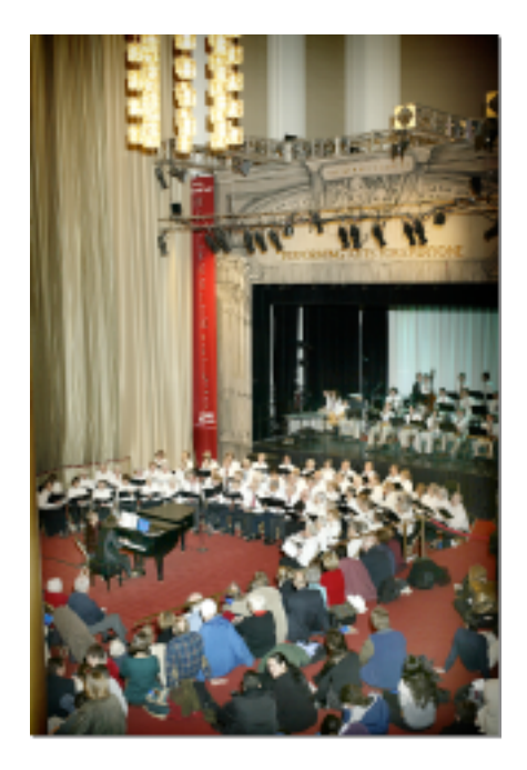
The Senior Singers' Chorale from the Washington, DC area study site, performing at the Millennium Stage of the Kennedy Center—one of several appearances they have made there.