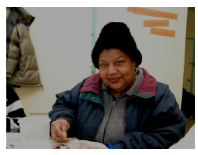
Participant in one of the Brooklyn art making groups, reflecting on her newly found sense of meaning and mastery: "This is my first time as an artist. Before one year ago, I only knew work".