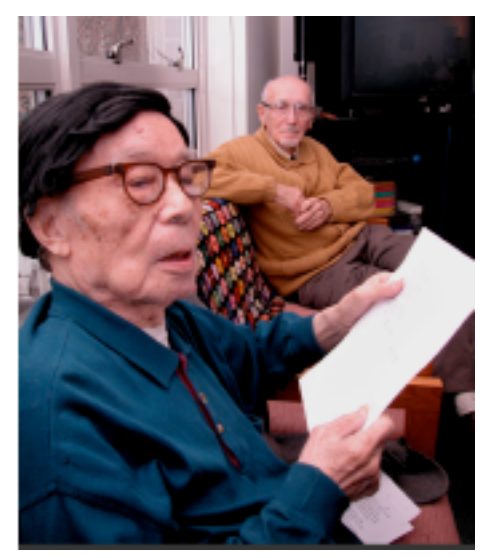
Oldest participant in the study—turned 101 during 2005—reading the poem he wrote to the Brooklyn site poetry group. These groups provide strong camaraderie.