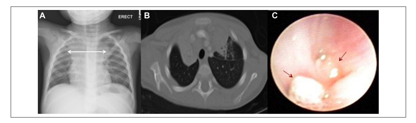
Figure 1. Radiographic and bronchoscopic findings. (A) Mediastinal widening on initial chest radiograph. (B) Extensive mediastinal lymphadenopathy, right main bronchus compression with right upper lobe collapse on chest computed tomography scan during hospital admission. (C) Endobronchial masses found during bronchoscopy. Mycobacterium avium-intracellulare complex was isolated from endobronchial granulation tissue.

<sup>a</sup>Patient had mild chronic anemia with otherwise normal T and B blood cell counts and lymphocyte subpopulations. Lymphocyte proliferation to phytohemagluttinin (PHA) yielded normal values. Dihydrorhodamine test for chronic granulomatous disease showed normal oxidative burst.