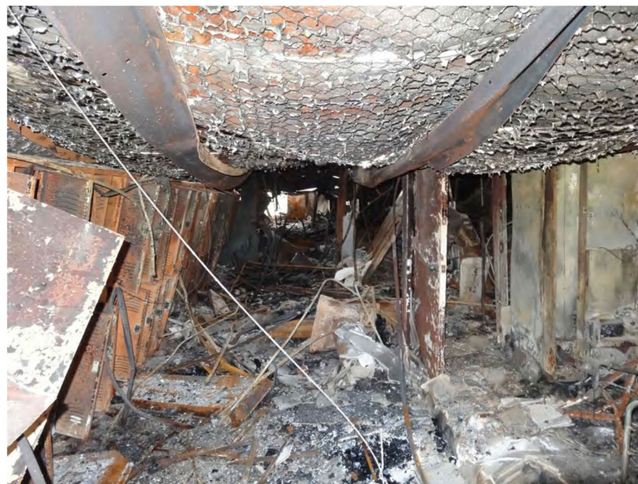
Figure 2. Interior of Burned Northeast Section of West Intermediate School (Source: ABS Consulting 2015).