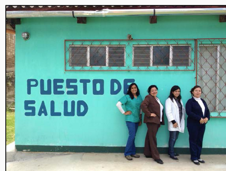
Puesto De Salud in Chiquilaja, Guatemala

For my research study, I recruited and interviewed families at the rural clinic of Chiquilaja. The study utilized 24-hour food recalls, weight and height measures to calculate BMI, arm circumference to measure malnutrition, and waist circumference to measure adiposity in order to compare and contrast the health statuses of caregivers and their children.