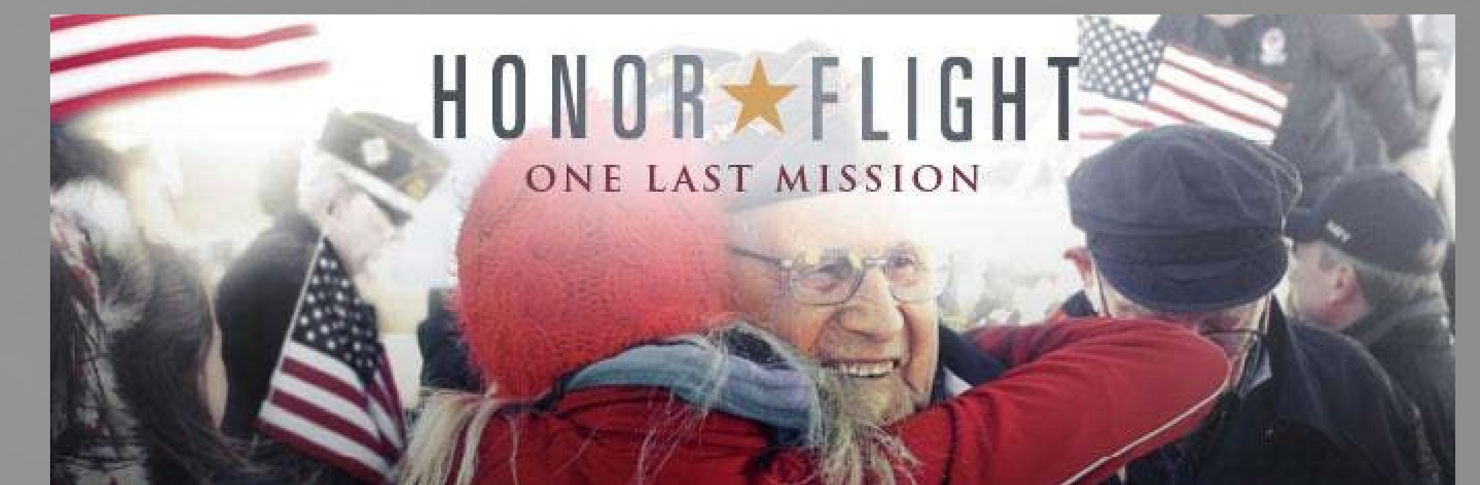
Cover of the movie Honor Flight, about bringing veterans from all over the United States to Washington D.C. to see the memorials; Held a screening for this movie for the GWU community; Shows how much listening can mean to veterans