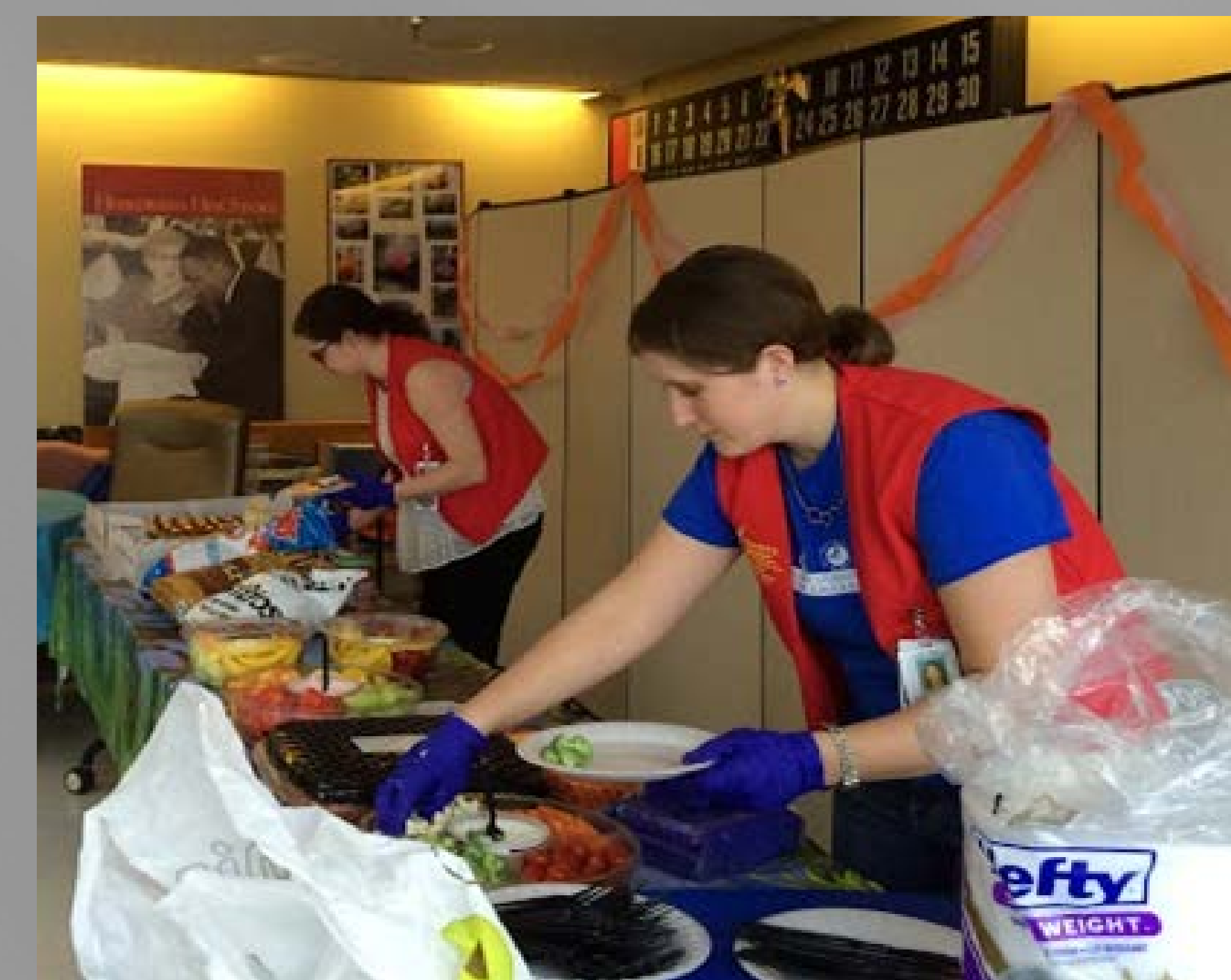
Starter Project: Hosting the monthly Birthday Celebration at the CLC. For October we also brought baby pumpkins and paint supplies as a craft.