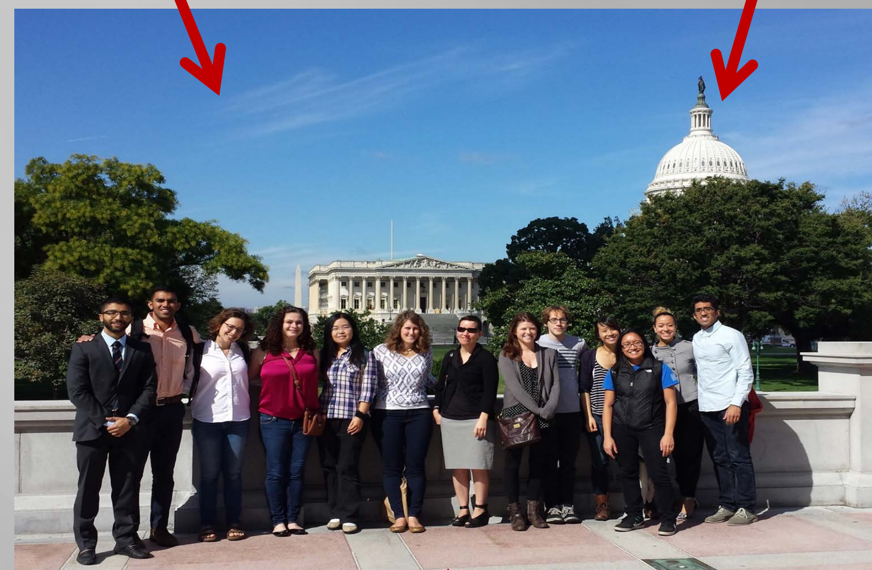
ISCOPE Veteran History Project Team outside the Library of Congress, in front of the Capital Building