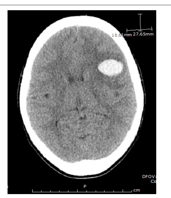
Figure 1: Emergent head CT demonstrating the larger of two frontoparietal hemorrhages.