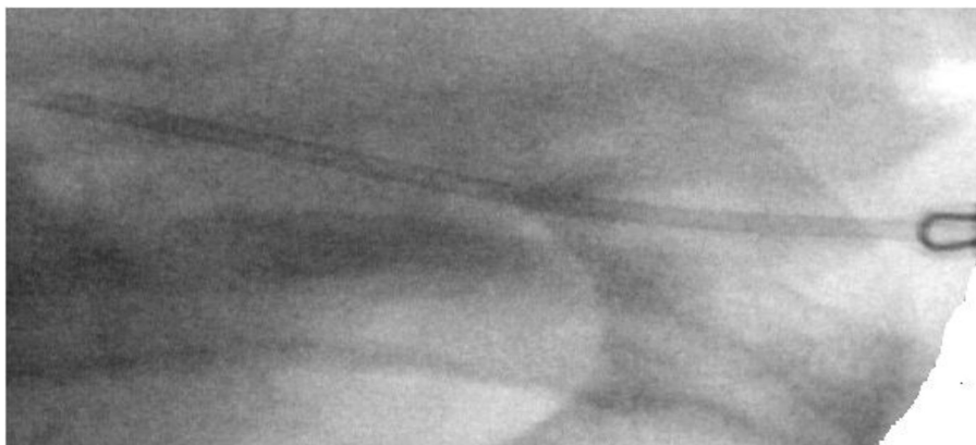
Figure 3 A micropuncture access set was used to puncture through the soft tissues on the lateral pectoral region into a thoraco-acromial vein branch which had been exposed laterally on the subclavian vein. A snare device was passed through an 8-French sheath to engage and remove the needle.

needle bent from overlying pressure of the soft tissue without excessive applied force.