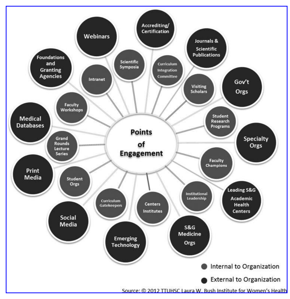
FIG. 3. Schematic of stakeholders internal and external to an organization and tools to be engaged in implementing sex and gender concepts into medial education. Examples of Accrediting and Certification Bodies: Liaison committee on Medical Education (LCME), Accreditation Council for Graduate Medical Education (ACGME), American College of Obstetrics and Gynecology (ACOG); Curriculum Gatekeepers: Deans of Curriculum, Block Leaders, Educational Policy Committee, Curriculum Integration Committee, Core Faculty Group Leading the Curriculum Integration; Emerging Technologies: Smart Phone and Tablet Apps; Faculty Champions: Grass-roots engagement of Basic and Clinical Faculty to Pioneer Efforts and Engage Others; Institutional Leadership: President, Deans, Assoc/Asst Deans, Chairs; Sex and Gender (SG) Medicine-Focused Organizations & Initiatives: Society for Women's Health Research, Sex and Gender Women's Health Collaborative, Organization for the Study of Sex Differences, International Society of Gender Medicine, North American Menopause Society; Government Organizations: Department of Health and Human Services Office for Women's Health, National Institutes of Health Office for Research on Women's Health, Federal Drug Administration, Health Resource Service Administration; Medical Database/Search Engines: Pub Med, Ovid, Up-to-Date, Medscape, MD Consult; Journals & Other Scientific Publications: Gender Medicine, Journal of Women's Health, Institute of Medicine Reports; Print Media: Monographs, Reviews, Commentaries; Specialty Organizations: American Academy of Family Medicine (AAFM), American Board of Internal Medicine (ABIM), American College of Physicians (ACP), American Congress of Obstetrics and Gynecology (ACOG), Association of Professors in Gynecology and Obstetrics (APGO), American Medical Student Association (AMSA), Association of American Medical Colleges AAMC); Social Media: Blogs, Twitter, Facebook, LinkedIn Webinars & Online C.

Initial funding for the Sex and Gender Women's Health Collaborative came from American Medical Women's Association and American College of Women's Health Physicians. The future challenge is to find mechanisms and funds to sustain the site through outreach to various professional