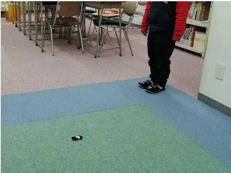
Figure 2 - Unplugged activity: Student follows commands from other students in order to reach the marked carpet tile