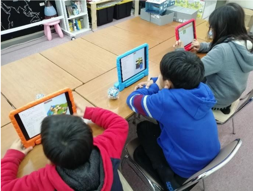
Figure 1 - Students using the Swift Playground application