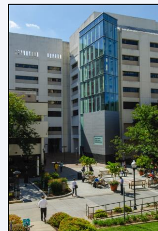
The George Washington School of Medicine & Health Sciences