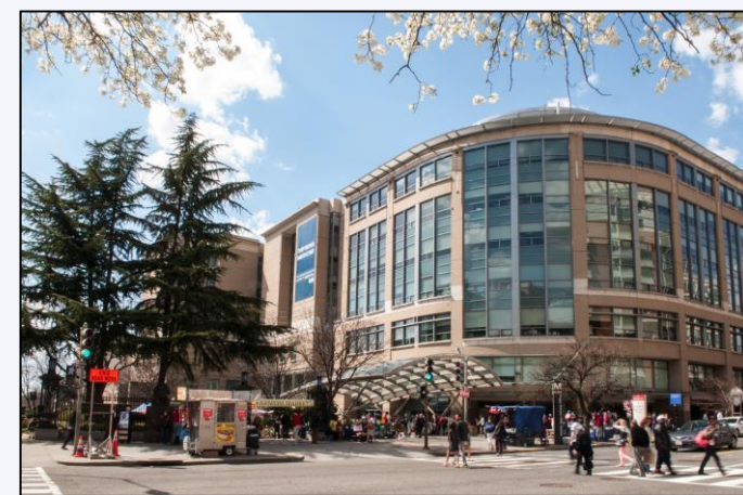
The George Washington University Hospital

The proposal highlights seven focus areas to reduce LGBT+ health disparities: