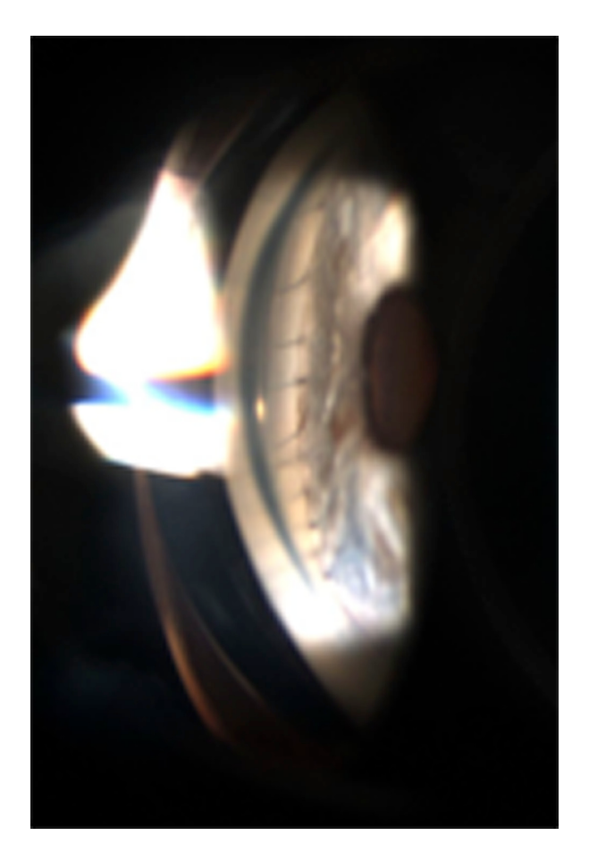
Figure 2 Gonioscopic view of the cyclodialysis cleft after repair. Note: The sutures are visible crossing the angle and previous cyclodialysis cleft is no longer present.

side of the limbus (Figure 3). To ensure that ciliary body was incorporated into each pass, the sutures were tugged on intraoperatively and the iris root was evaluated for movement with mechanical pull. Additionally, as more sutures were