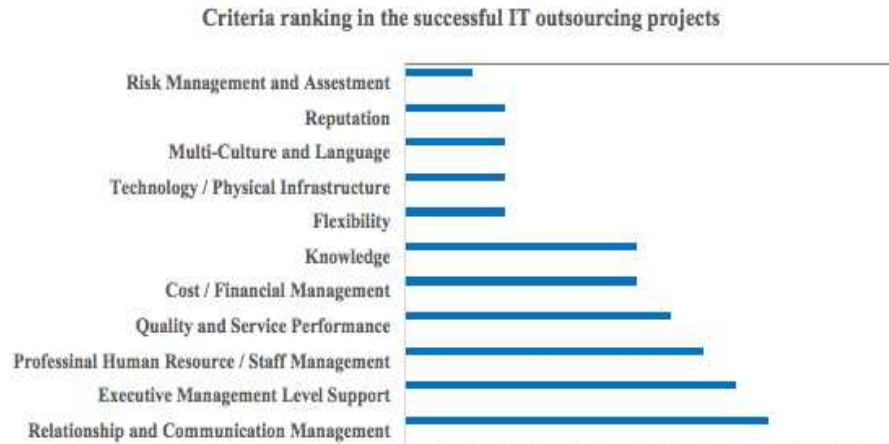
Figure 3. Criteria ranking in the successful IT outsourcing projects

[3, 31]. The result of the criteria emphasized to the assessment for efficiency and ability of suppliers and organizations in the implementation IT project. In other words, this approach was preferred to use in determining the criteria of successful IT outsourcing projects, the result is showed in Figure