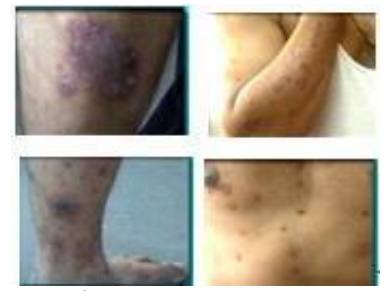
Figure 4: Before Treatment

Recurrent throat infections and getting different mental levels of anger easily along with past