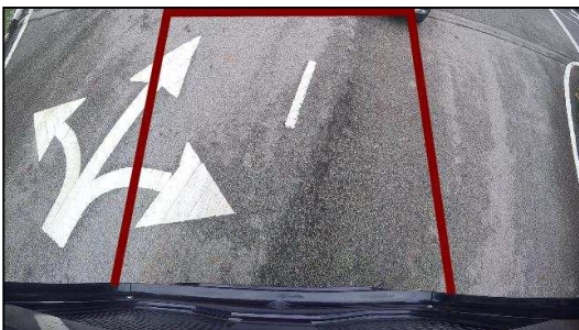
Figure 4: The bus excessive imaginary line at the rear encroached into the adjacent lane during left turn manoeuvre at intersection.

Based on study by Sleath et al. (2006), the difference of rear swing out performance of the actual and design bus is 28%. As the difference is quite small, the predicted impact from the observation may be otherwise (safe) for long bus. The results will be slightly different from the actual 15-m bus where the longer wheelbase and shorter rear overhang would show better rear swing out performance 4 . Whilst the analysis was qualitative, the method will not be able to confirm the predicted impact of long bus rear swing out performance. Nevertheless, near miss impact shall suggest better on-road long bus rear swing out performance.