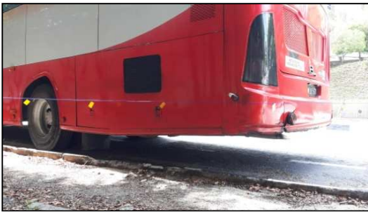
Figure 5: Damages mark on the left rear side of a 12-metre bus.

bus body caused by rear swing out of a normal 12-metre bus. Therefore, allowing a single rigid, long buses of 15-metre to operate in Malaysia may require the drivers to undergo a special training.