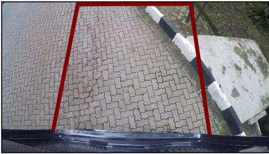
Figure 3: Sign post viewed in the video recording while the bus exiting a side bus stop.

From the observations made through the video recording, it was found the video recording was able to represent the excessive 3 m of long bus. It was evidenced that the potential infrastructures that could cause damages to the infrastructure and bus whenever the bus maneuver at intersections, roundabouts or bus stops were recorded. Road furniture such as sign post and road curb were viewed in the video recording (see Figure 3). Besides, encroachment of the bus rear into the adjacent lane was observed during maneuver and it may hit other vehicles (see Figure 4).