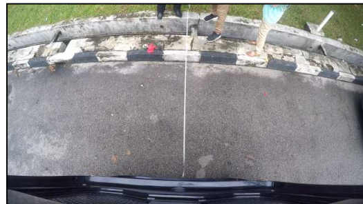
Figure 2: The view angle of the action camera.

The action camera was mounted on a standard mounting accessory pointing rearward at the rear and the mounting was attached to the bus body using a 3M double sided tapes. The view angle was 120 degrees and set to represent the excessive 3 m of long bus (overall length of 15 m) from the rear bumper (see Figure 2). Any infrastructure viewed in the video recording will be identified as the possible impact.