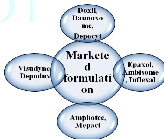
Figure 3: Some of the marketed formulation of liposomes