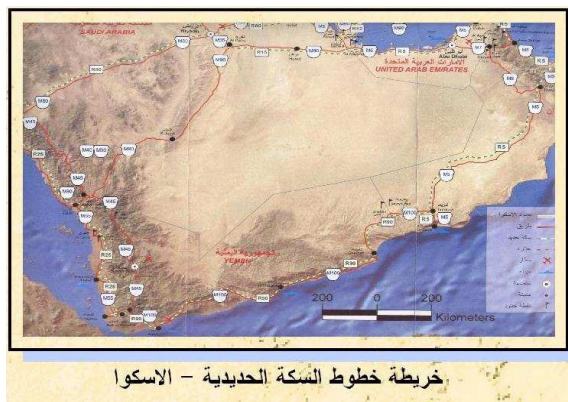
Figure2: Road network Map in the Republic of Yemen.

The map demonstrates the railway route from Hodeida to the capital city Sana'a was first proposed, the rising through the slopes to the capital to be made along the Wadi Fersh, an unfriendly locale, the primary chain of Serat being crossed at 8038 feet. This was not acknowledged totally, but rather a line over the coast front plain through Bajil and among the lower slopes similar to Hajile, which lies at the foot of the steep crags on which is the castle of Menakha, was authorized, and it was relatively finished. Menakha is an essential key position almost somewhere between Hodeida and Sana'a. The trace of another and much longer route was studied, likewise beginning from Hodeida, yet making a profound U-shape circle toward the south and passing not a long way from Kataba on the border of the British Aden colony, before turning north to Sana'a, which would be passed to reach Amran still more further north. The proposed line would go through Beit-el-Fakih Zabid, Hais, Taiz, Ibb, Yarim, Dhamar and Maber to Sana'a, this project being eventually endorsed by the Ottoman Government.