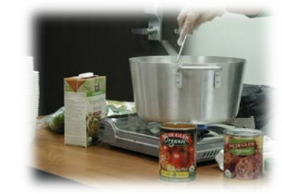
WHOLE FOODS COOKING DEMO AT HIMMELFARB LIBRARY

care of themselves, Himmelfarb librarians developed a three-pronged Healthy Living initiative, launched in fall 2012. The program focused on diet/nutrition, exercise, and stress reduction, and the initiative included new and unique additions to the collections, such as board games, hula hoops, and yoga kits for study breaks, and multiple activities with partners from both on and off-campus. Activities included cooking demonstrations, a "March madness" basketball shoot off to benefit the Healing Clinic, and yoga sessions. Student reaction was very positive. Comments included: "The food samples were great and the easy microwave recipes are