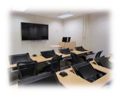
COMPUTER CLASSROOM B103

Once again the Library saw a number of improvements to its physical plant. The wireless network was expanded and enhanced in spring 2013. Zero-client workstations were installed on the first and third floors. Classroom technology was upgraded throughout the Library and the B103 computer classroom reconfigured with desks that improve visibility around monitors. Ergonomic chairs were placed at all workstations and study tables on the third floor. Stairwells were painted and tiles replaced carpet in hard-to-clean areas.