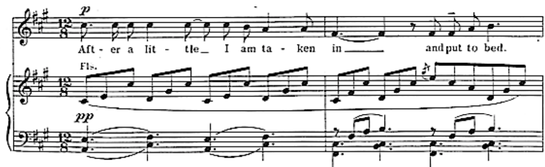
Example 1 Samuel Barber's Knoxville: Summer of 1915 , Op. 24, (23)

Heyman describes the compositional structure of Knoxville: Summer of 1915 as being written in a "declamatory style – a lyric recitative with a freely varied metrical beat" (Heyman Catalogue 287). Barber uses a series of alternating compound meters in this work, facilitating a use of vernacular text setting which allows the vocal line to be easily understood. The medium-range tessitura of the vocal line is a key element in creating an understandable text, as shown in example 1: