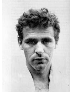
Author and Poet James Agee