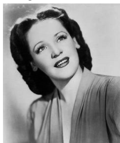
Soprano Eleanor Steber