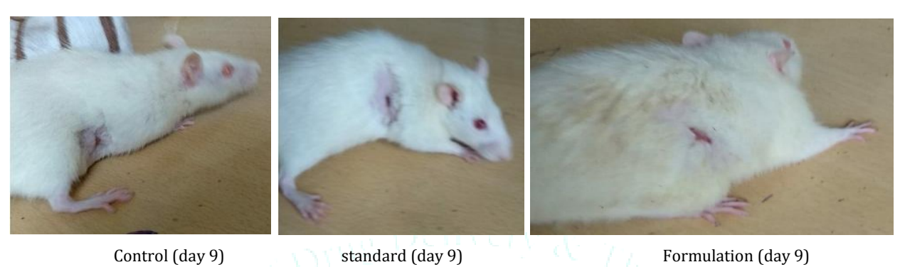
Figure 5: 9th day photographs