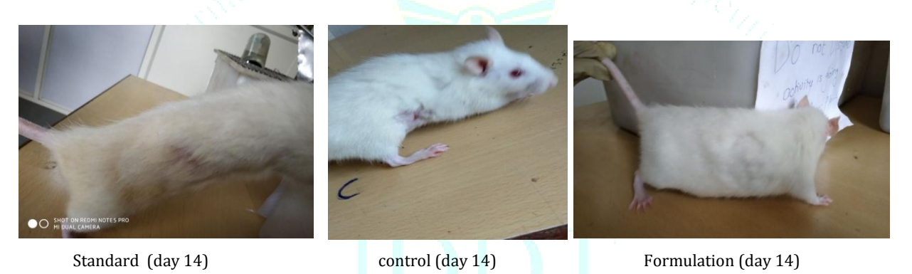
Figure 6: 14th day photographs