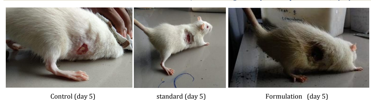
Figure 4: 5th day photographs