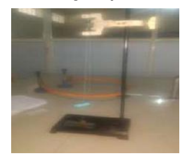
Figure 9: Spreadability test

ISSN: 2250-1177 [30] CODEN (USA): JDDTAO