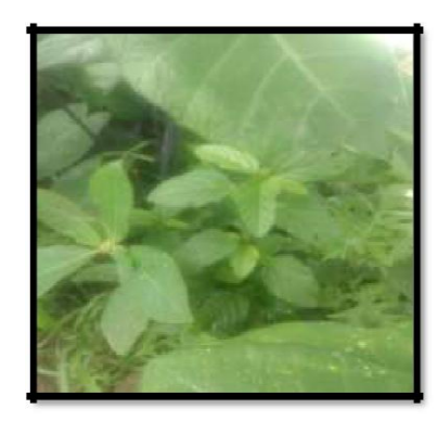
Figure 2: Aghada

Synonyms- Apamarg, Aghata, Onga ,ApangMadhogantha B.S.-It Is Obtained From Dried Leaves Of Achryanthes Aspera Family- Amaranthaceae