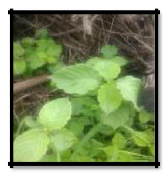
Figure 1: Bavanchi