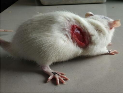
standard (day 1)