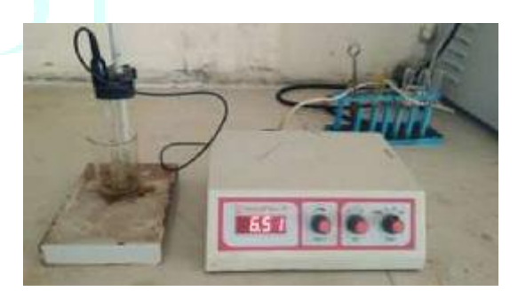
Figure 8: pH