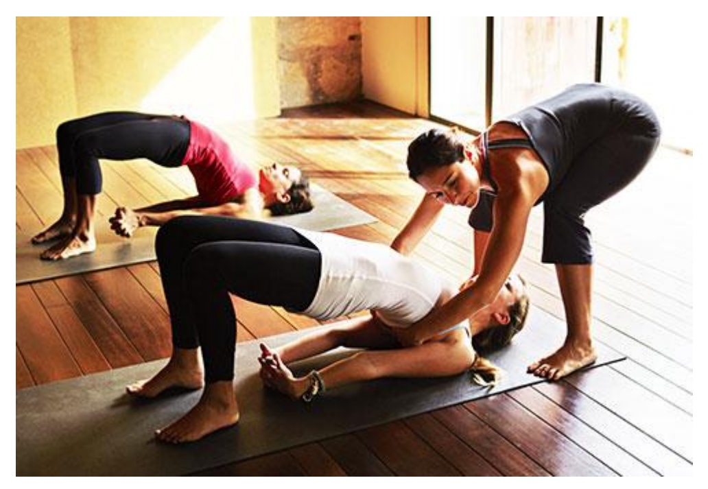
Figure 1: Practice of yoga

Meditate: A few minutes of practice per day can help ease anxiety. "Research suggests that daily meditation may alter the brain's neural pathways, making you more resilient to stress. It's simple. Sit up straight with both feet on the floor. Close your eyes. Focus your attention on reciting -- out loud or silently -- a positive mantra such as "I feel at peace" or "I love myself." Place one hand on your belly to sync the mantra with your breaths. Let any distracting thoughts float by like clouds.