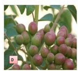
Figure 1: Murraya koenigii (Meetha Neem or Curry patta) [A] Whole plant [B] Inflorescence [C] Single flower [D] Fruits

Margins irregularly creatate, petioles 2-3 mm long, flowers are bisexual, white, funnel shaped sweetly scented, stalked, complete, ebracteate, regular with average diameter of fully opened flower being in average 1.12 cm inflorescence, terminal cymes each bearing 60-90 flowers <sup>6</sup>. Fruits, round to oblong, 1.4 to 1.6 cm long, 1 to 1.2 cm in diameter; weight, 880 mg; volume, 895 microlitres, fully ripe fruits, black with a very shining surface, the number of fruits per cluster varying from 32 to 80. Seed, one in each fruit, 11 mm long, 8 mm in diameter, colour spinach green <sup>7</sup>.