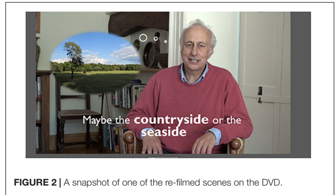
FIGURE 2 | A snapshot of one of the re-filmed scenes on the DVD.

Stroke survivors were recruited through 24 community stroke support groups in West Yorkshire and the West Midlands. CS attended the group meetings to introduce the study or sent the group leader a brief introduction to allow their members to contact her if they were interested in participating. The inclusion criteria required participants to: (1) have received a formal diagnosis of stroke; (2) have been discharged from hospital to live within the local community; (3) be aged 18 or over and;