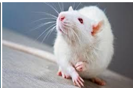
Figure 4: Ataxic gait and convulsion (group T2, T3, T4)