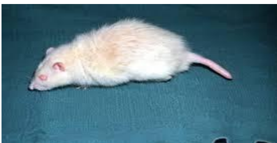
Figure 3: Lacrimation and rough hair coat (group T2, T3, T4)