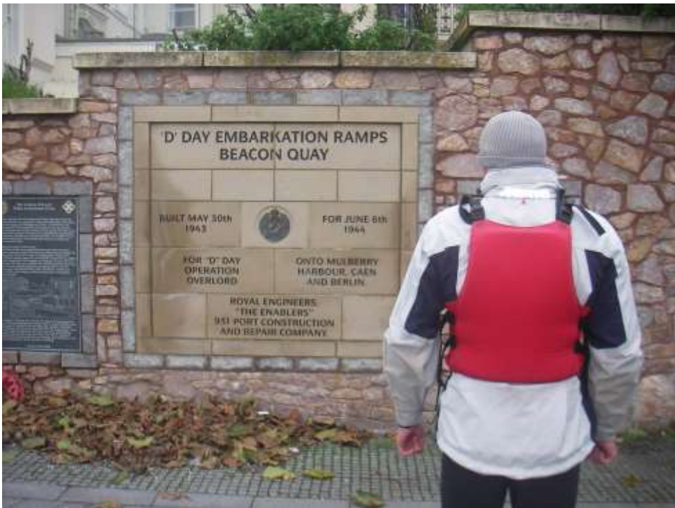
Plate 4: Thoughtful contemplation