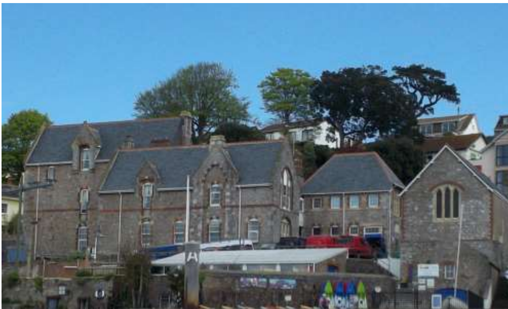
Plate 2: British Seamen's Boys' Home