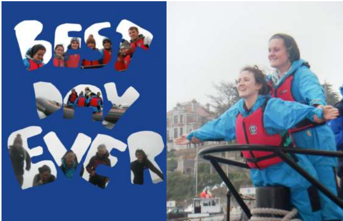
Plate 5: 'The Best Day Ever' – Student Photograph