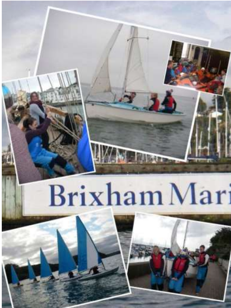
Plate 7: Student Montage