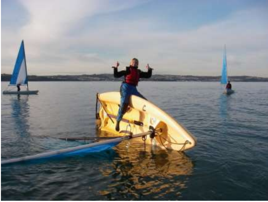
Plate 8: Successful dry capsize