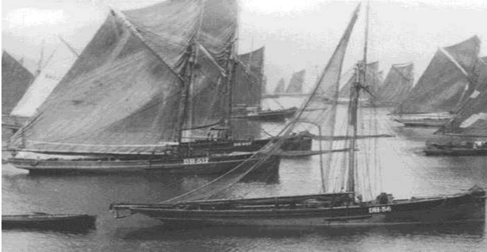
Plate 3: Brixham Trawlers