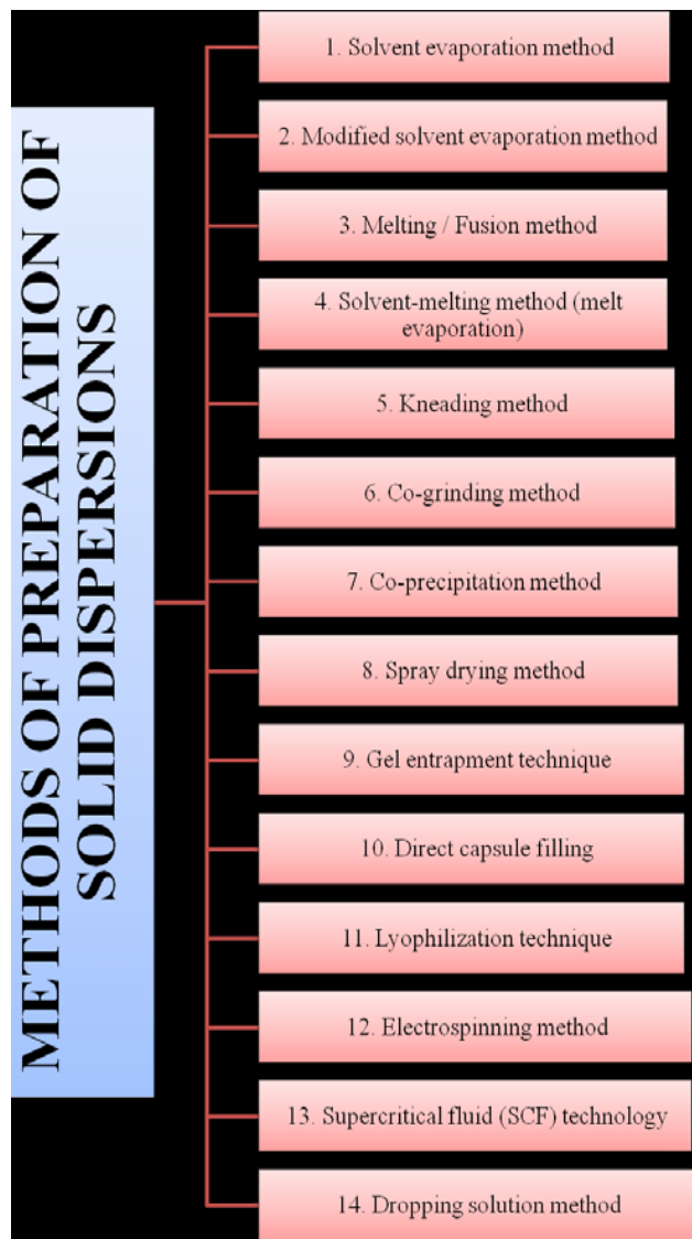
Fig. 2: Method of preparation of solid dispersions