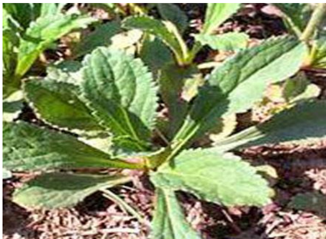
Figure 1: Plant of Picrorhiza kurroa

Vanillin Hydrochloride Test :- Extract solution when treated with few drops of Vanillin Hydrochloride reagent gives purple and red color. (Test only for condensed Tannins.).