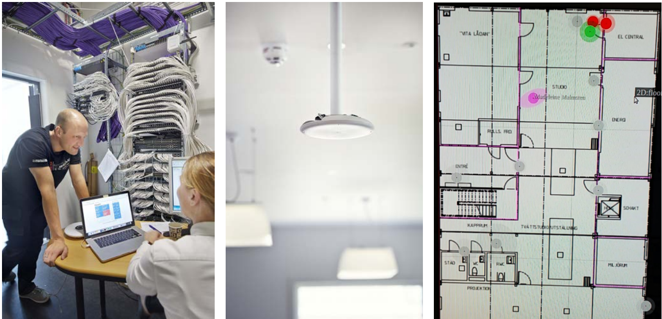
Figure 2. To the left and in the middle: Data centre inside HSB Living Lab and Quuppa tag tracking system. To the right: tag position data visualization at the entrance floor.

The so-called Home Energy Management project aims at improving the utilization and operation of building services in residential houses by: