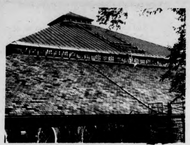
Ongoing replacement of broken panes on the top of The Cage