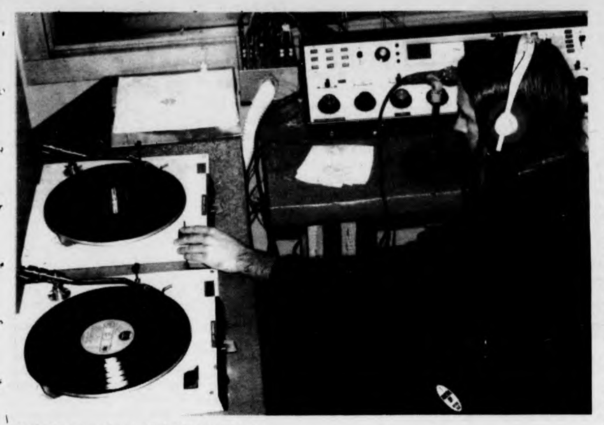
lason Feinman during a Tuesday evening show, broadcasting from the WRJR studio.